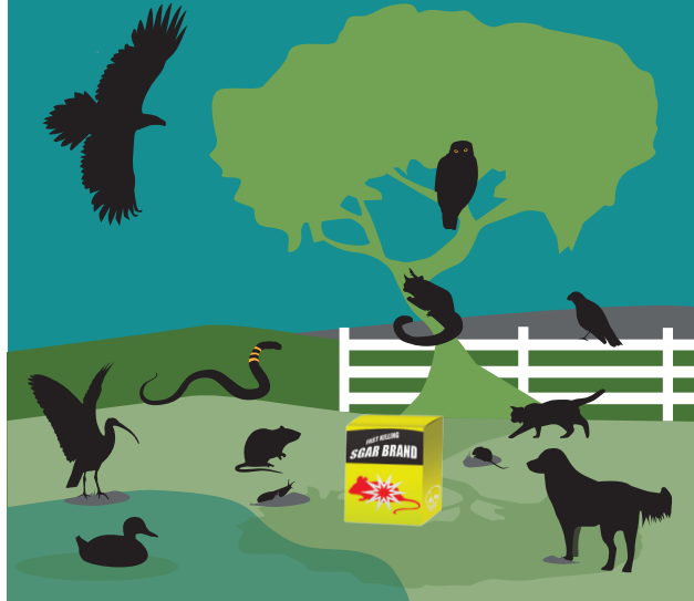
Deadly impacts for our pets and local wildlife

SGARs can kill birds or animals that might eat dead or dying rodents.